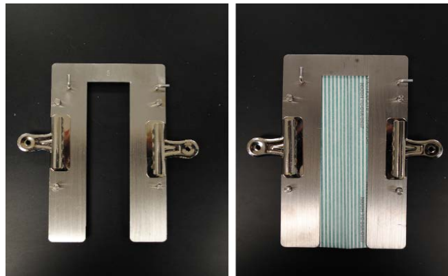
Figure 1: (a) Top Panel: A 45° angle Flammability tester used for testing the flammability of respirators and other head/facial PPE (16 CFR 1610 Test Method). (b) Middle Panel: Flammability tester components. The flow control meter (Left). The igniter and specimen rack with specimen holder mounted in place (Right). (c) Bottom Panel: The specimen holder without (Left) and with a specimen (Right).